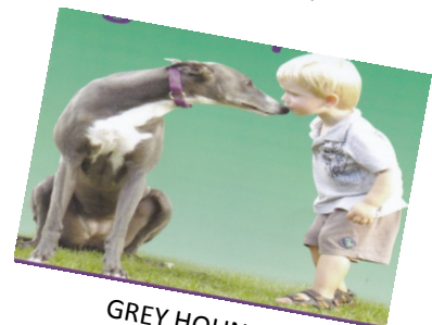
GREY HOUND FRIENDS

ALLORA DISTRICT HISTORICAL SOCIETY DEMONSTRATION DAY