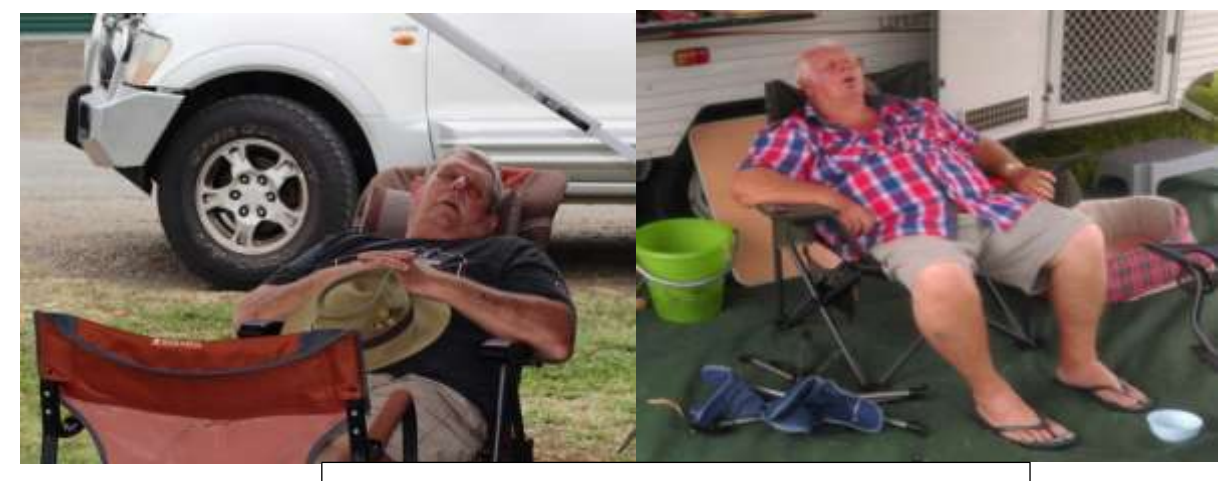
Gentlemen at Rest