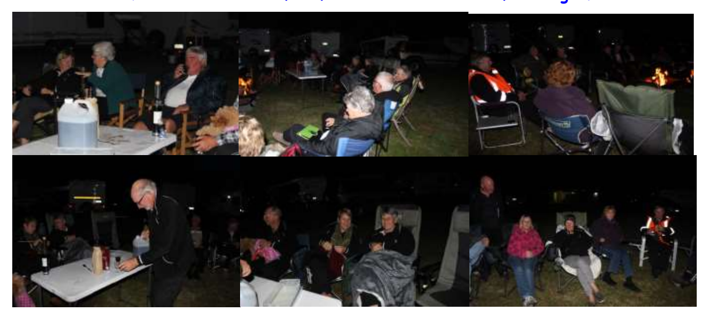
Welcome to our New Visitors