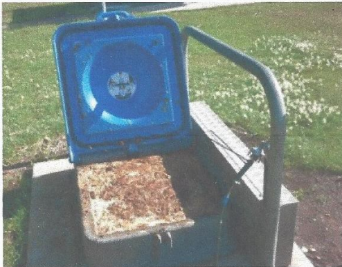
The dump point at Apex Park, Allora, after a busy weekend.