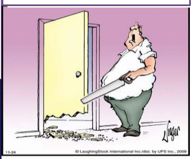
"That should clear the rug."