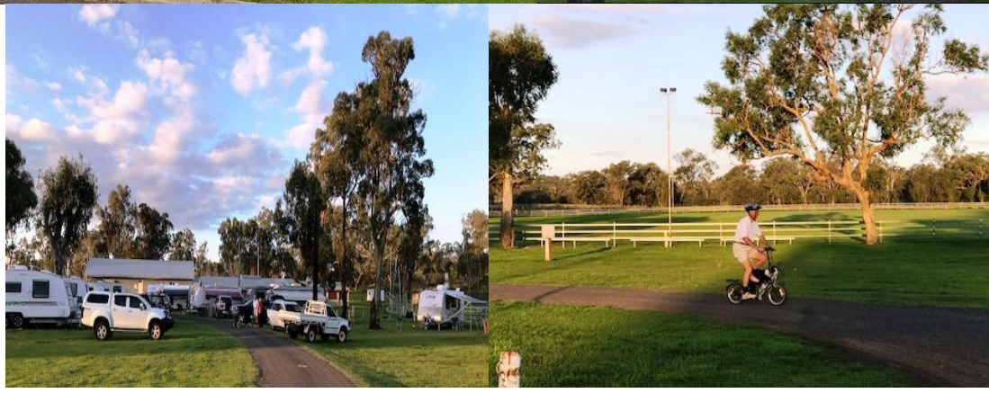
Goombungee saw the long anticipated return of "Sue's Morning Walk'