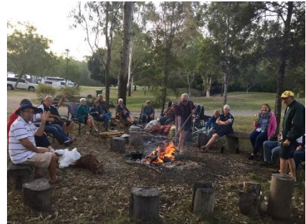
Awesome fire and company