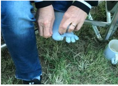
Sarah's toe socks