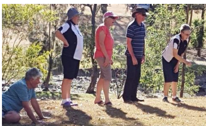
Bocce (no disc bowls)