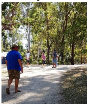
Checking out the site.