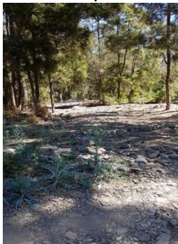
Bush Camp site.