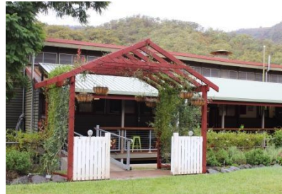
Entrance to Stinson Plane Wreck Walking Track.