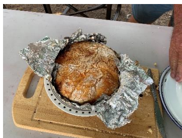
Dampers to share