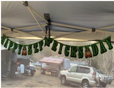
St Patricks Day