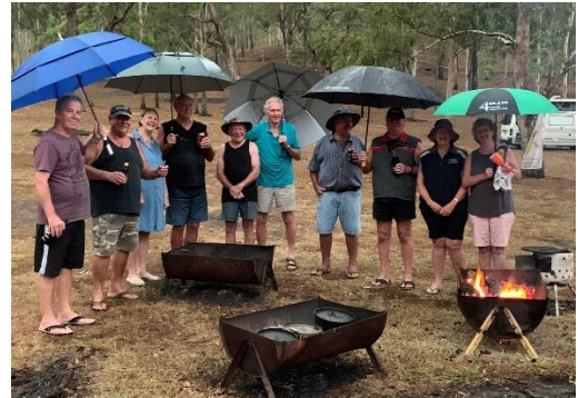
Then the rain came