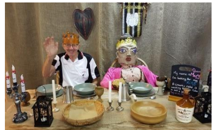
Drive after lunch.